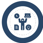
LEARNING & EVENTS