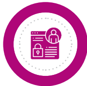
PRIVACY, TECHNOLOGY & CYBERSECURITY